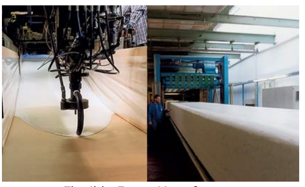
Flexible Foam Manufacture