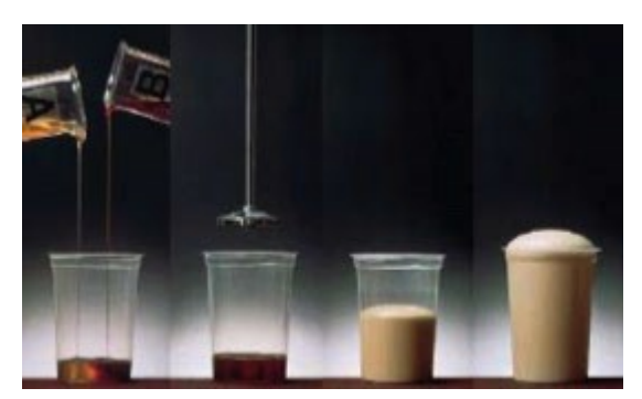
The Reaction of Polyurethane